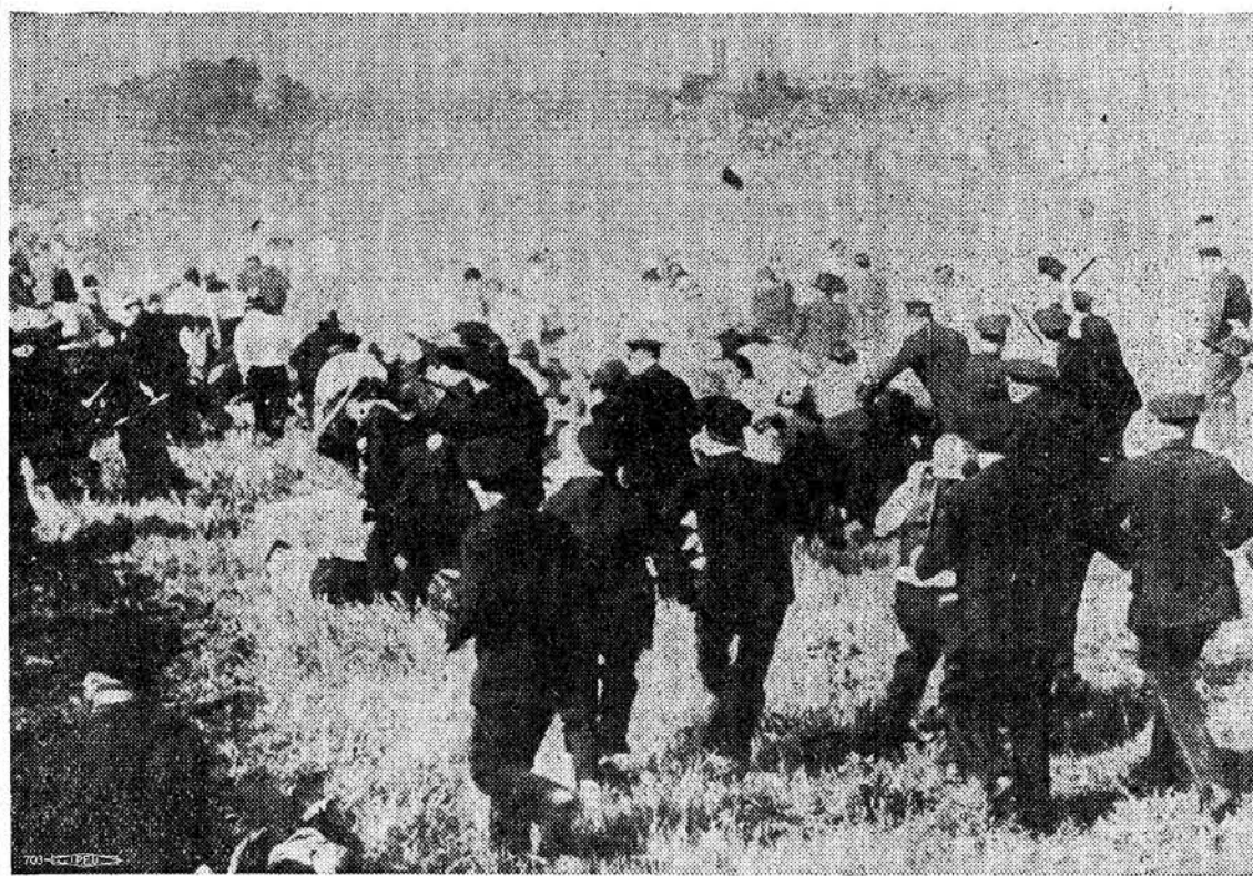
On Memorial Day, 1937, ten workers were murdered by Chicago police during a holiday strike parade. This photograph was taken from a suppressed newsreel of the brutal assault upon unarmed men, women and children. The pictures were hastily withdrawn from circulation because Mayor Kelly feared their showing might "incite riots" among horrified Chicago workers. The terrible Memorial Day massacre of eight years ago is depicted by Theodore Kovalessky this week in his column "Diary of a Steelworker."