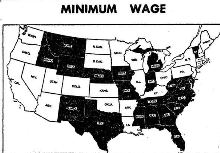
Twenty-one states have no minimum wage laws, the above chart shows. States which have no minimums are shown in black. White areas show states that have minimum wage regulations for women and minors. Only two states—Connecticut and New York—have laws establishing minimum wages for men, and even these are largely inoperative.

Why aren't these prisoners returned to their native land? An Associated Press dispatch of May 11 reveals one of the reasons: "Sugar beet growers have been assured of enough prisoners of war to carry out cultivation operations through July." Blocking, thinning and weeding sugar beets in the broiling sun is one of the hardest tasks in farming. It is likewise one of the lowest paid.