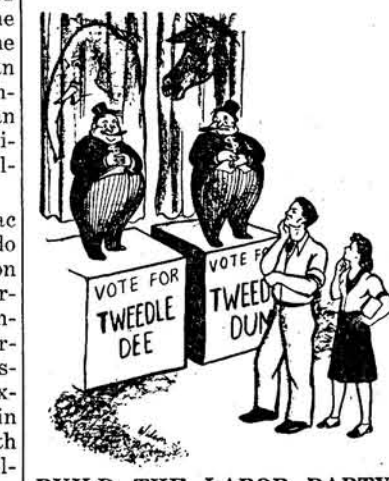
BUILD THE LABOR PARTY!

While endorsing this program with acclaim, the rank and file delegates to the conference showed very clearly their distrust of their "leaders." They forced them to give a public pledge that, regardless of the outcome of the elections, they would never again seek coalition with the Tories. But by special pleading, these labor misleaders were able to keep their hands free to form a coalition with the Liberal Party, thereby laying the groundwork for a new political betrayal of the British workers.