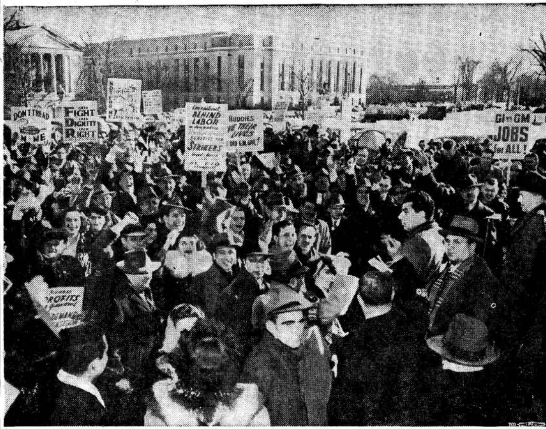
Delegates from unions in all parts of Connecticut massed outside the state capitol at Hartford, on January 29, where they had marched to demand a special session of the legislature to provide unemployment compensation immediately for all strikers.