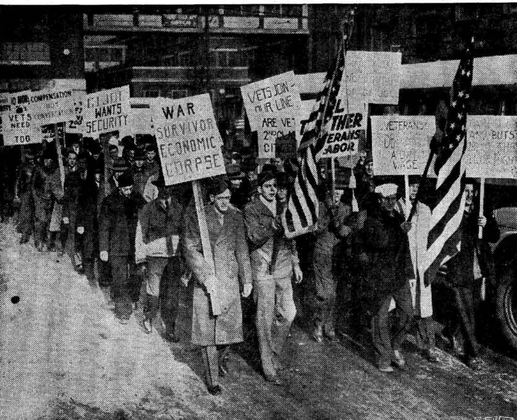
A contingent of veterans photographed as they left Philadelphia to join a march on the state capitol at Harrisburg. They are part of 600 ex-GIs, members of the striking CIO United Electrical, Radio and Machine Workers, who on January 24 conducted the first veterans' march on a state capitol following World War II. They demanded a special session of the State Legislature to vote a veterans' bonus, to provide striking veterans with state unemployment compensation, and to act on housing.