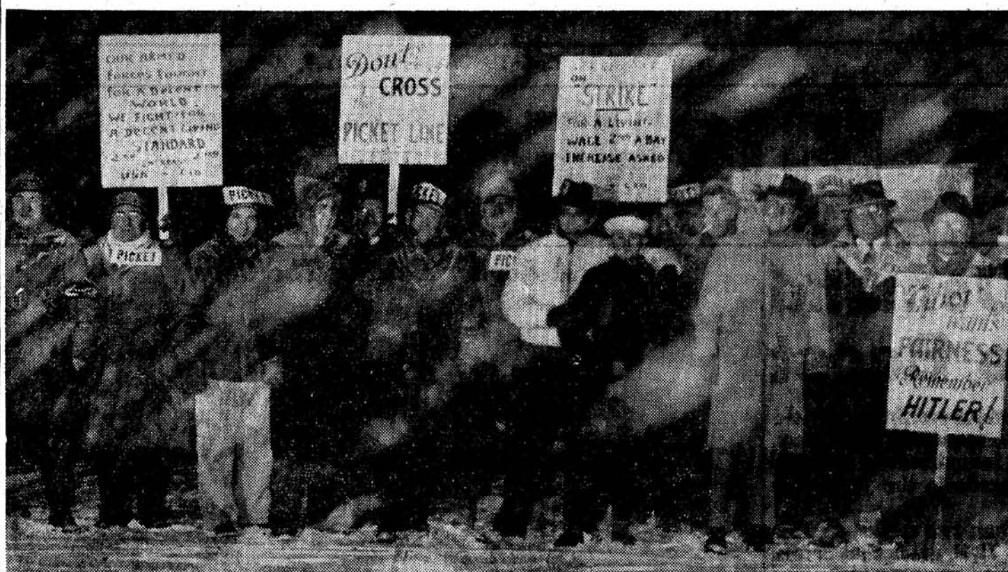
No scabs have dared to crash this determined picket line at the main gate of the Bethlehem Steel Company's mammoth plant at Bethlehem, Pa., closed down tight on January 21. Defying ankle-deep snow, cold and sharp winds,