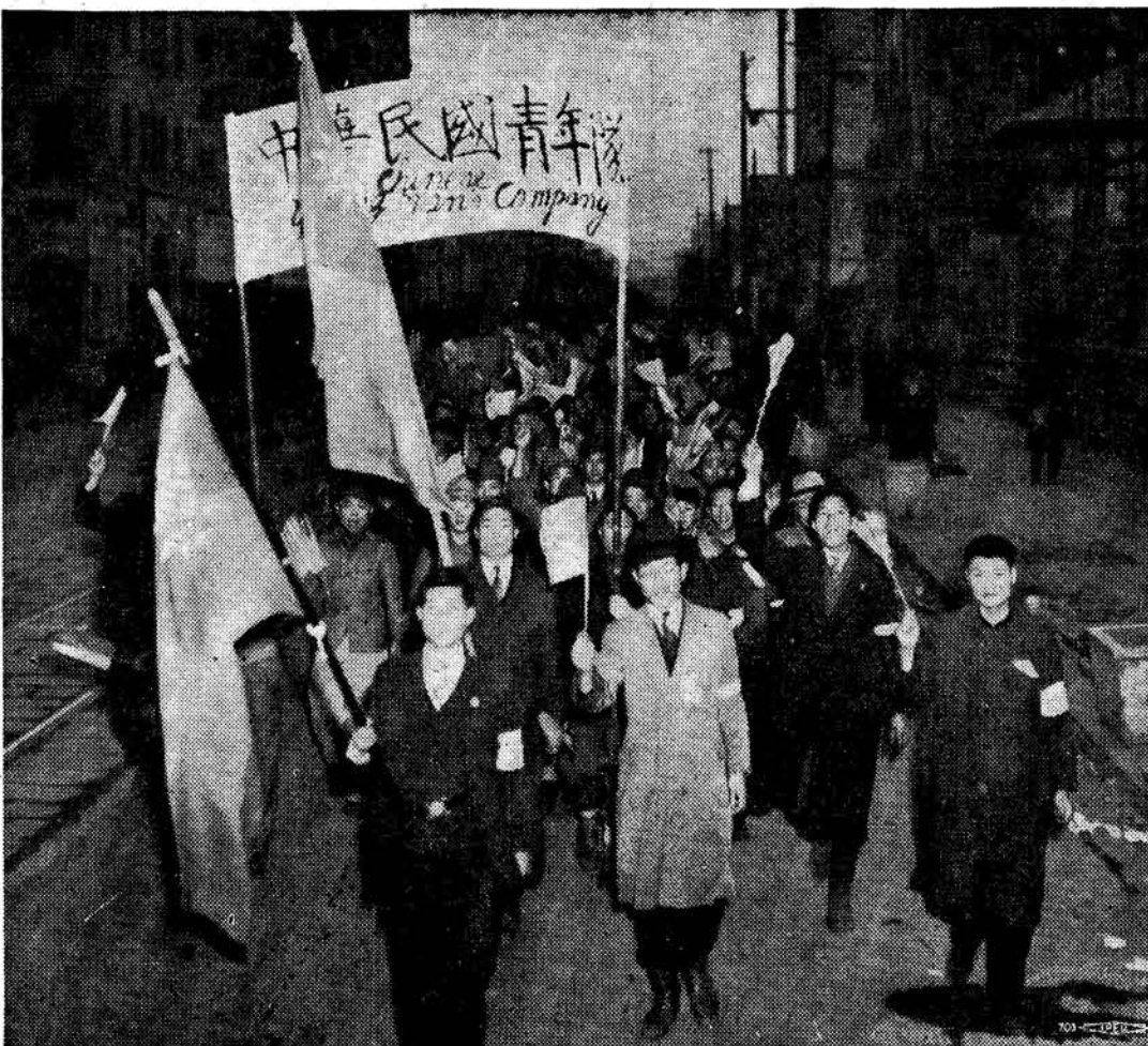
Inspired by the example set by American GI demonstrators abroad, these crowds of Chinese workers who had been forced to labor in Japan during the war, paraded down Tokyo's Ginza on January 25. In huge mass meetings they protested against the delay in returning them to their home in China and Korea.