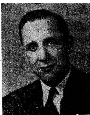
HOWARD LERNER Governor