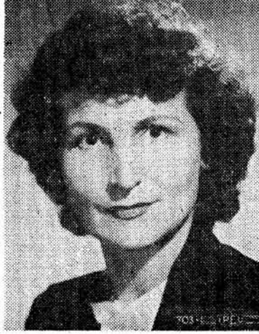
GENORA DOLLINGER U. S. Senator