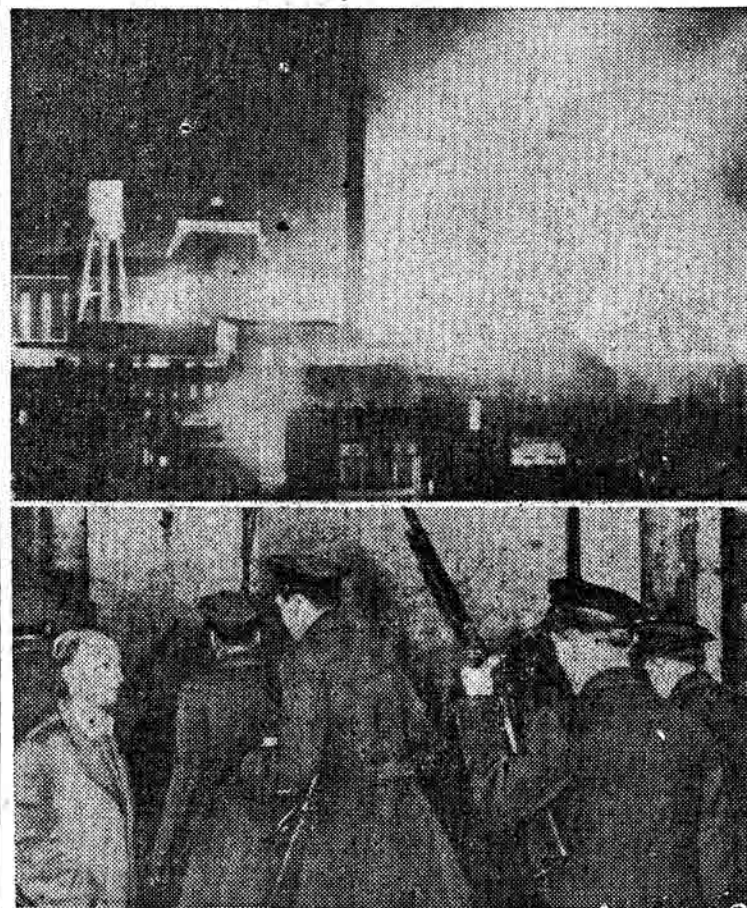
Demanding prison reforms, inmates at Western State Penitentiary in Pittsburgh revolt to call attention to brutal conditions. Top: building where prison labor manufactures auto license plates is swept by flames. Bottom: some of the 700 armed police, called in to end the demonstration, enter building where 1,100 prisoners had seized five guards as hostages. Pittsburgh revolt is latest in a series of prison demonstrations throughout nation.

whose family faces eviction because his 73-year-old father cannot truthfully sign an oath that his son does not belong to any organization on the Attorney General's blacklist.