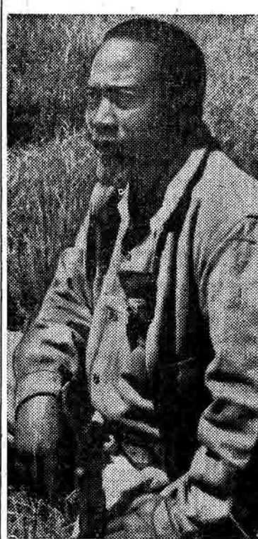
JOMO KENYATTA , leading Kenya nationalist figure, has been framed and sentenced to seven years imprisonment at hard labor, on the charge that he organized and inspired the Mau Mau movement among Kikuyu tribesmen. The Mau Mau, a secret society, has been employing terrorist means in their struggle for liberation. While Kenyatta does not favor employing these means, he is an ardent nationalist fighter. Five others, unionists and nationalists, were also sentenced to 7 years each.

After a century of oppression culminating in the present South African government's anti-Negro fury, the peoples of Africa are on the move, adding their weight to the revolutionary ferment in Asia, the Middle East and Latin America. From Bolivia to Kenya and on to China the masses are awakening.