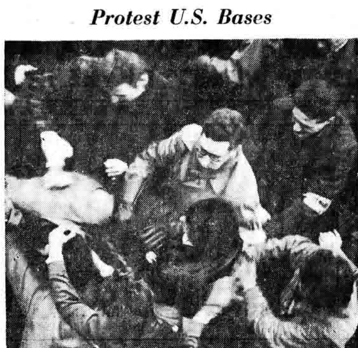
Incident during recent demonstration, when several hundred Britons marched on American air-force base near London. The demonstrators carried placards calling on the U.S. to abandon its British bases. The British population is alarmed over knowledge that American planes fly overhead with A-bombs.

massive students' meeting voted overwhelmingly in favor of unilateral renunciation of the bomb by Britain — and a special issue of the students' magazine Isis, wholly devoted to the horrors of nuclear warfare, set in motion a university referendum on this issue. (Two-thirds of the students entering the poll declared in favor of Britain stopping nuclear tests until there can be an opportunity to discuss disarmament with the Soviet Union. Results were announced on March 15, according to the New York Herald Tribune. — Ed.)