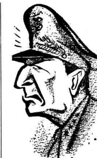
General Douglas MacArthur, who became a world symbol of reactionary American militarism, utilized his power as head of the U.S. army of occupation in Japan in 1948 to inspire the launching of a fierce witch-hunt against the Japanese Communist Party.

For 12 years, the rank-and-file Communist Party members were prevented even in a formal sense from participating in