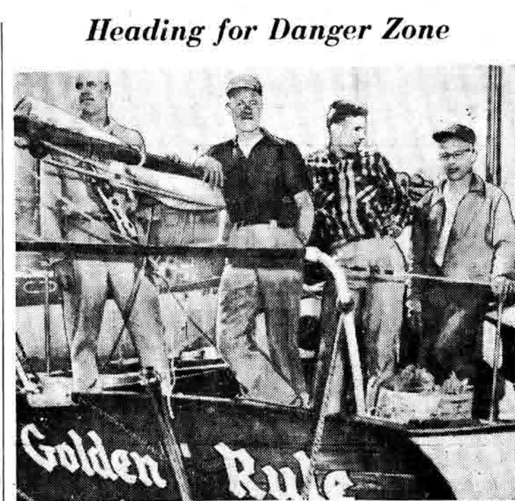
This small ketch, the Golden Rule, manned by four pacifists, sailed from San Pedro on March 25 to reach the danger zone of the Pacific where the U.S. has scheduled its Spring bomb tests. Last month the vessel was forced back by storms. The crew hopes to reach the Marshall Islands area and there, at the risk of their lives, challenge the tests.

Dr. Pauling pointed out that fallout from nuclear tests thus far might "mean that about one million persons die of leukemia and other diseases than would have otherwise." Their life span