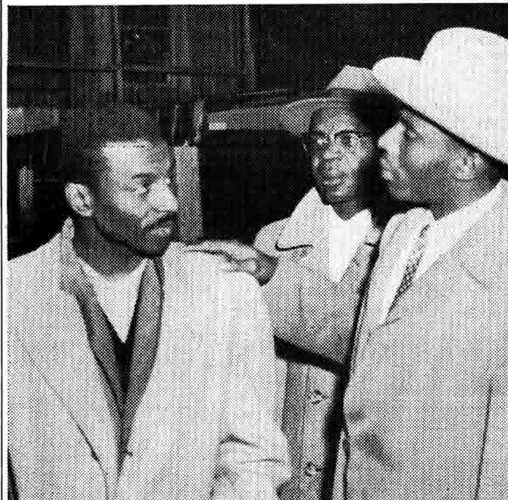
Rev. F. L. Shuttlesworth (left) of Birmingham, Ala., together with other parents of four Negro pupils, has filed federal suit to get Alabama's segregationist "school placement" law declared unconstitutional. He is shown here with friends following the bombing of his home by racists, Christmas 1956.