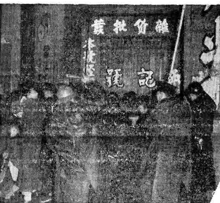
This picture was taken as 50,000 Chinese demonstrated against Chiang Kai-shek in 1946. The Chinese dictator had the backing of the American government, but that did not prevent the aroused Chinese masses from throwing him out of the country.

nese in the 1930's began threatening Wall Street's interests that the menace of Japanese militarism was discovered. U.S. imperialism fought World War II in the Pacific to "save" China for American exploitation.