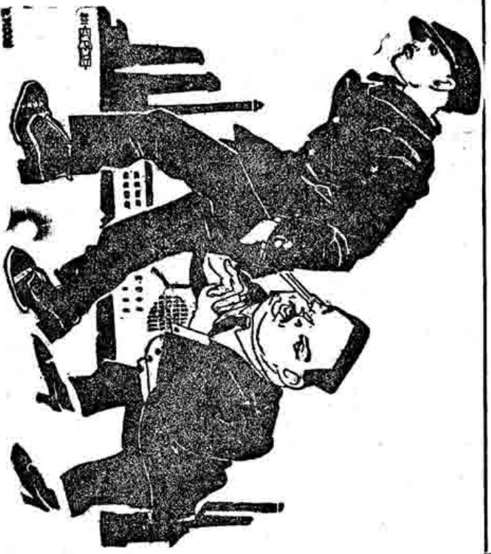
FRENCH WORKERS DEMAND SOVIET RECOGNITION

We must apply scientific methods in the building and controlling of workers' Party meetings to a greater extent than is now the case. Mass meetings are an important part of our propaganda and should be properly organized. A careful study of the foregoing hints will help a great deal in this direction. Whenever the Workers' Party calls a mass meeting it must be a real outpouring of the workers. Whenever a mass meeting is a failure it is an indication that the comrades in charge do not understand their job.