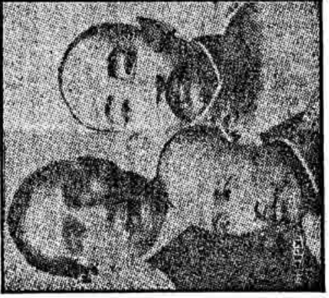
Sun Yat Sen (left), Wu Pei Fu (center), Chang Tso Lin

Secondly, the conference rejected the occupation of the Ruhr and recognized the necessity of evacuation, economically (immediately) and militarily (within a year or sooner). The reason: the occupation of the Ruhr at the present stage is dangerous from the point of view of the political situation of Europe, and inconvenient from the point of view of organized and systematic robbery of Germany. And that the Entente is preparing to rob Germany thoroughly and systematically, is hardly to be doubted.