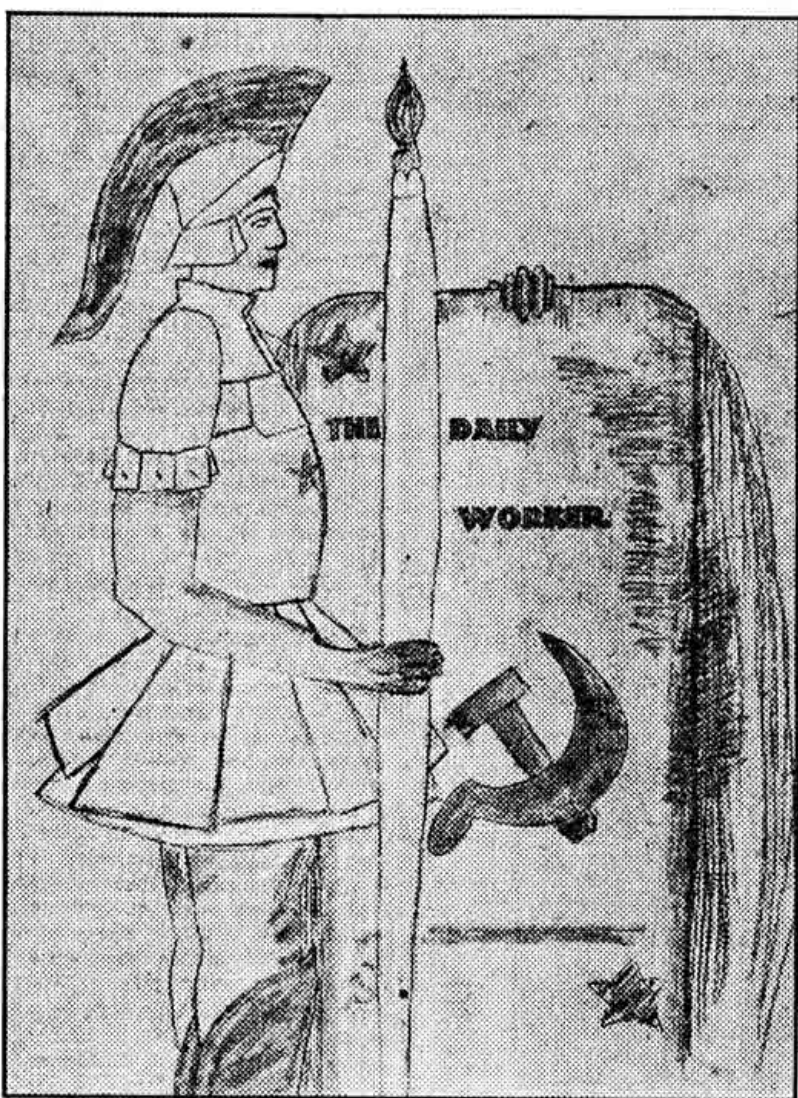
By Abe Stolar, Student Correspondent.