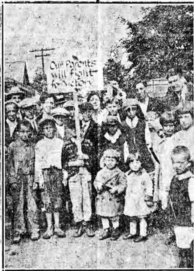
These strikers' children are about to board buses for Victory Playground.

the strike. The children assumed greater importance in the struggle, with the bosses trying to starve them on one hand and the workers, thru the general relief committee, doing their utmost to protect them from the bosses' starvation offensive.