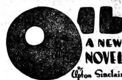
(Copyright, 1926, by Upton Sinclair)

"Results for the three quarters," says the New York Times , "have convinced the financial world that the railroads will set a new high record for all time in the current year in both gross and net."