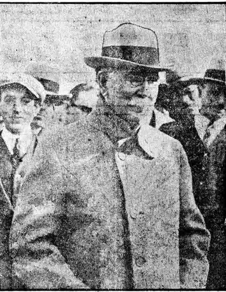
Here is a picture of Edward L. Doheny, oil magnate, taken in Washington where he is on trial with Albert B. Fall, former secretary of the interior, who gave away United States oil reserves.